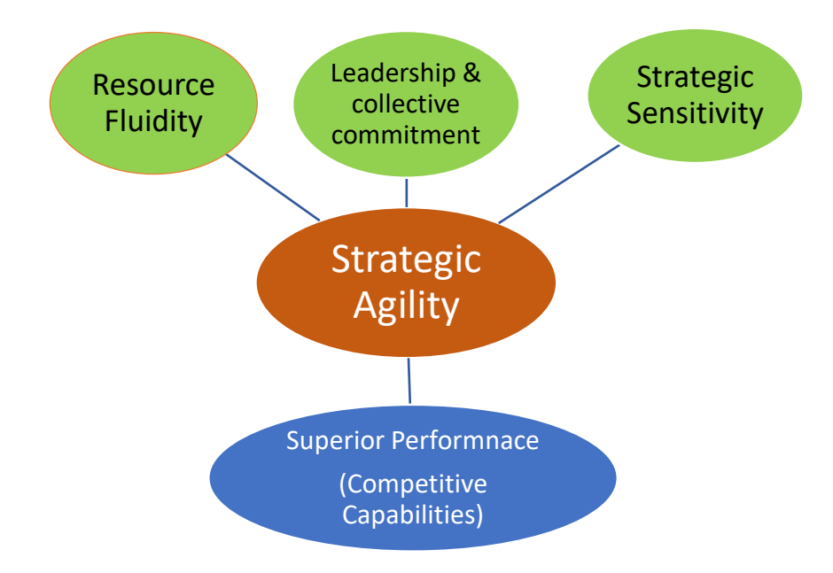
Figure 2. The Conceptual Model

A conceptual model can also be proposed that relate strategic agility to competitive capabilities as shown in Figure 2. The independent variable (X) is strategic agility with three dimensions of strategic sensitivity, leadership unity and share responsibility, and liquid reserves. The dependent variable (Y) is competitive capabilities which are measured with three indices of sustainability, profitability, customer satisfaction, innovation, and growth. This model has been developed based on an extensive review of agility literature and impact of agility on competitive capabilities of organizations.